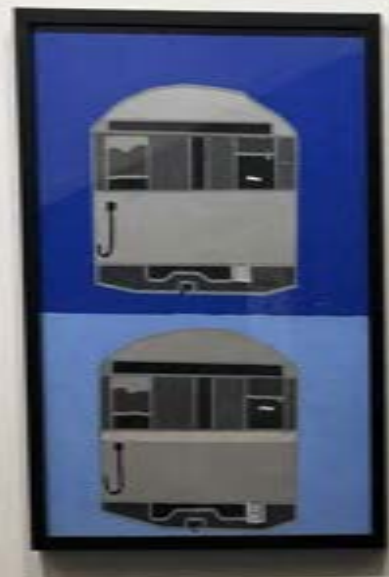
Images, left to right: Void, installation view, 2019, Bathurst Regional Art Gallery. Bird's-Eye View, installation view, UTS Tower Foyer, 2020.

Through our circulation program, UTS staff, students and the wider community enjoy daily contact with original artworks by Australian artists.